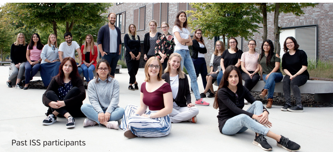
Past ISS participants

Institute of Molecular Biology (IMB) Mainz, Germany www.imb.de/ISS | iss@imb.de